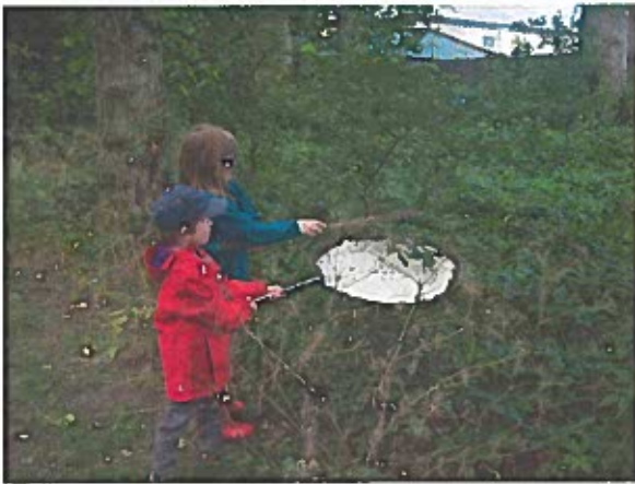
The children used special tools to find the mini-beasts in the grounds of The Bowes Museum. They really enjoyed decorating the ladybird houses they had built!