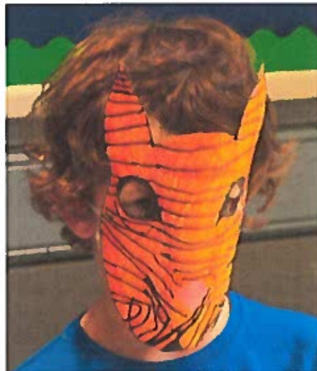
The children enjoyed making a squirrel mask to take home!